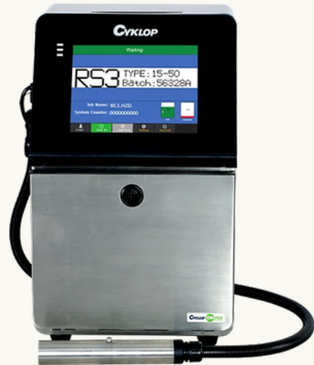
Continuous Inkjet Printer

The CM 750 is designed to meet the demanding requirements necessary for an industrial printer. High reliability, even in the harshest working environments. Working with the CM 750 is made easy by the quick and clean cartridge-changing facility.