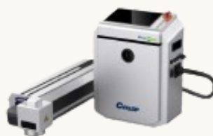
Laser Marking System