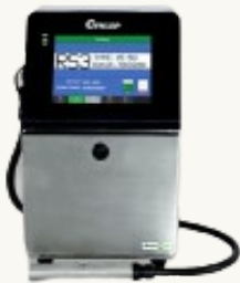
Continuous Inkjet Printer