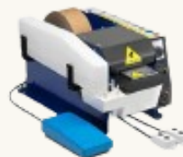
Electric Packing Tape Dispenser