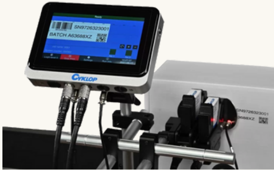
Thermal Inkjet Printer

A specific kind of inkjet printer created for use in the packaging sector is the CM 600 Thermal Inkjet Printer. On a range of packaging materials, it provides high-resolution and high-quality printing using thermal inkjet technology.